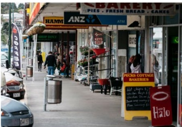
Glen Eden town centre.